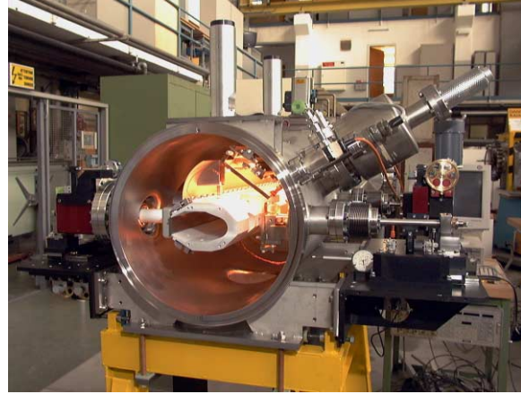
Figure 1: The new septum 23

Proper choice of electrode material and preparation is of utmost importance for electrostatic septa. From tests and past experience, we chose the Peraluman 300 DIN5754 aluminium alloy, anodised with a 6 –8 \mu\text{m} oxide layer for the cathode. The septum anode consists of a 0.1 mm molybdenum foil. In order to prepare an electrostatic septum for its operational use (around 10 MV/m) it must first be conditioned. Initially, the cathode septum distance is set to a large gap of 30 mm, and the assembly is conditioned up to 280 kV. The cathode septum distance is then set to a small gap of 17 mm and the assembly is conditioned to 250 kV. Typically, the first step (large gap) takes several hours, while the second step (small gap) takes less than one hour. After conditioning, the septum sustains its operational voltage of about 160 kV across a 17mm gap with negligible current ( <1 \mu\text{A} ).