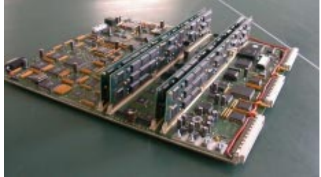
Figure 3: The FLT Trigger Decision Unit. Also visible four subcards which perform the calculation of all possible pair masses of a given event.

of the track. By each subsequent hit determination the track measurement is refined. Once the track is reconstructed in all FLT detector superlayers, it is used to determine the charge of the particle and its momentum. This calculation is performed by the Track Parameter Unit (TPU). The TPU is essentially a fast, look-up table based calculator. It also is able to reject duplicated tracks. They can, for example, be generated in overlap regions of different tracking systems. After the kinematical reconstruction the result is sent to the Trigger Decision Unit (TDU).