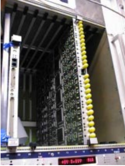
Figure 2: The FLT Track Finding Unit: Ten such 9U VME boards are housed in each crate. In total 74 TFUs are needed.

second data stream is constant and synchronized by the bunch crossing clock of 10.4 MHz (from top to bottom in Fig. 1). The data is collected by detector Link Boards [11] and is sent via optical links to the TFUs using the same data transmission piggy back boards which have been described for the muon and the high- p_T pretrigger systems. The Link Boards are used to “map” the detector onto the FLT network.