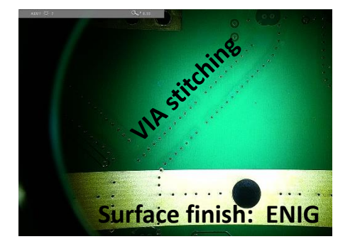
Figure 1: Via stitching and surface finish implemented on the VFE card.

We specify a standard lead-free solder paste and require the bake-out of components prior to assembly. In order to avoid systematic failures on large parts of the production, factory acceptance tests (FATs) are mandatory, in particular automatic optical inspection (AOI) and electrical testing of all completed VFE cards. The test results allow a continuous monitoring of the first pass yield (FPY). This allows for spotting shifts in the production quality early on. We require the