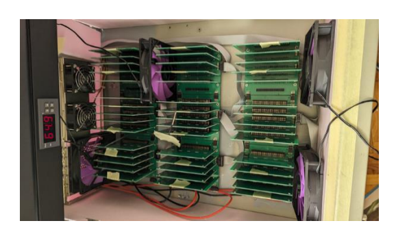
Figure 6: ESS box for 45 VFE and 9 LVR cards with ventilators for ambient air exchange (left) as well as ventilators for internal air steering. Stable temperatures of 70 \pm 1.5^{\circ} C were achieved.