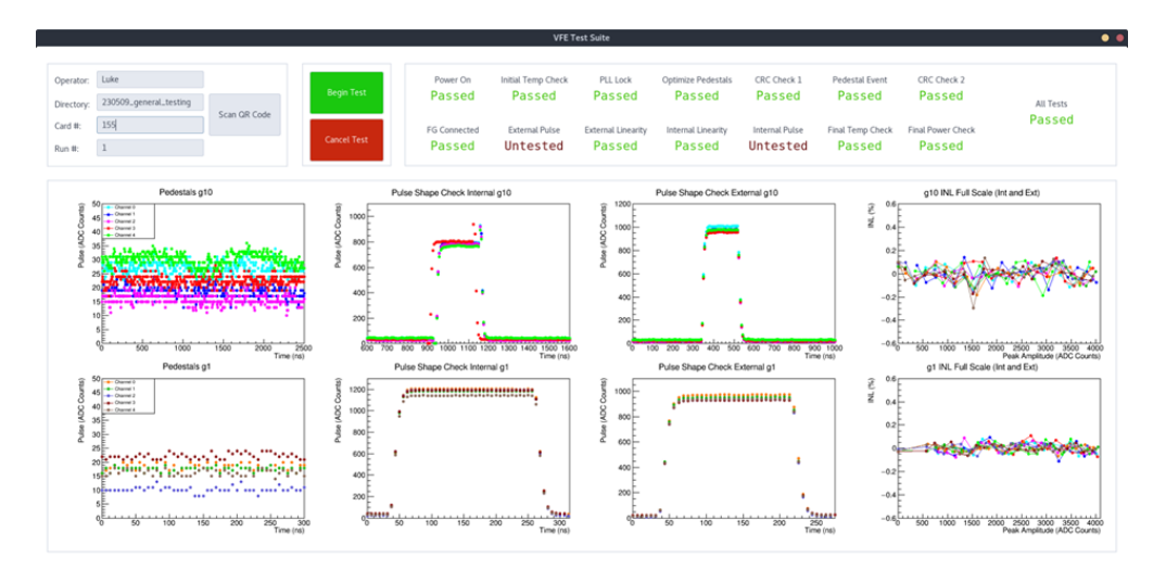
Figure 4: VFE test-setup graphical user interface.

way, there are always 4 batches in the production and qualification pipeline: one is produced, one is electrically tested, one is environmental stress screened, and one is calibrated.