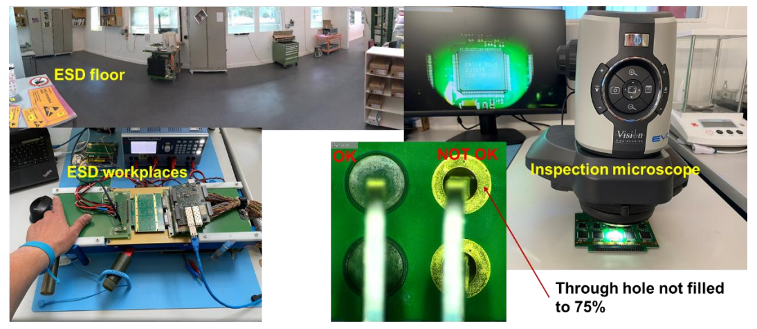
Figure 3: Images of the antistatic floor (top left) in our electronics laboratory, ESD workplace (bottom left), PCB inspection microscope (right) and insufficiently filled through hole (bottom middle).

Finally, the manufacturer shall use processes and materials compliant with laws and regulations for the protection of the environment. In particular, RoHS compliant components shall be used and the manufacturer shall be ISO 14001 certified.