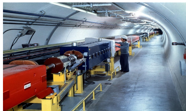
Figure 2: View of a SPS' arc with quadrupole (red), dipole (blue) magnets, and the interposed short straight sections. The latter must be removed to have access for the coating of the magnet's vacuum chambers.

The successful operation of SPS after LS1, with significant electron cloud reduction, validated the concept of a-C coating. To optimise the logistics for successive coating campaigns, a modular in-situ coating equipment was developed for the vacuum chambers of the Main Bending dipoles of type B (MBB) and the QF. To have access in situ for the coating of both types of chambers, it is necessary to remove the interposed SSS elements (Short Straight Section, Fig. 2). The SSS elements are transported to a dedicated coating lab, in a surface building, where they are a-C coated. In parallel, QF and MBB vacuum chambers are coated in situ in the SPS tunnel. After coating of all vacuum chambers, the SSS elements are re-installed in SPS, aligned, and connected to the adjacent vacuum chambers.