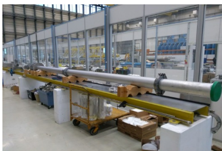
Figure 5: Drift chambers (159-mm diameter) on the horizontal assembling bench, before insertion in the vertical solenoid for DC cylindrical magnetron sputtering.

Finally, the drift chambers (159-mm internal diameter) were coated by DC cylindrical magnetron sputtering from 10-mm diameter graphite rods in the system described in reference [5].