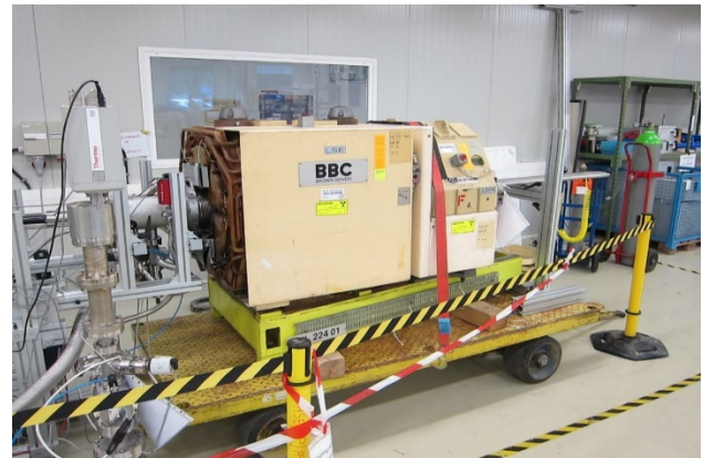
Figure 4: Fixed coating unit in operation on SSS QF magnet in surface coating lab.

One more week is then necessary to re-install the RF fingers, transport all the coated SSS-QF elements back to SPS tunnel, and for installation in their dedicated positions. Alignment of all elements is performed by the survey team, prior to vacuum connection of all vacuum chambers. Once a full sector is completely connected, the pump-down of the sector is launched. The increase of pump-down time, due to outgassing of coated vacuum chambers, was negligible.