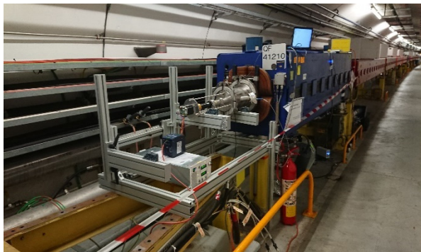
Figure 3: Mobile coating unit in operation in SPS tunnel. The vacuum chambers in the QF magnets are a-C coated in situ in the tunnel.

Then, four weeks are necessary to accomplish the coating. In the SPS tunnel, two mobile coating units allow to coat the chambers in the QF magnets at an average rate of two chambers / week.