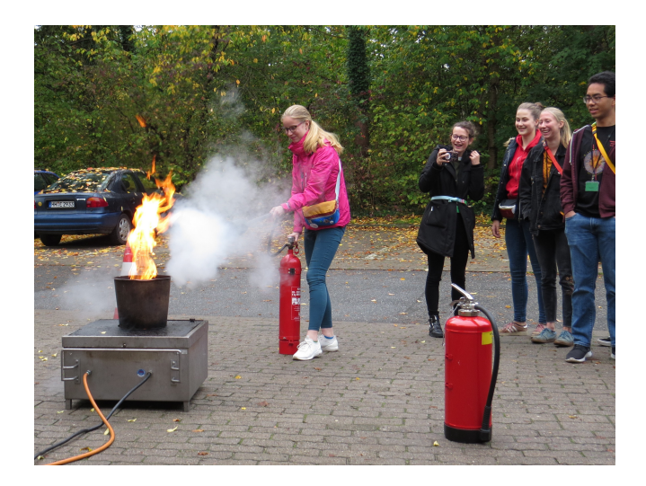
Fig. 2. A participant of the 2019 edition of the competition during a fire extinguisher training.

The mutual presentations are very important for us to develop an understanding of the other team's experiment, as we will be responsible for taking data for both experiments. The lectures given by the experts from CERN and DESY serve us also as