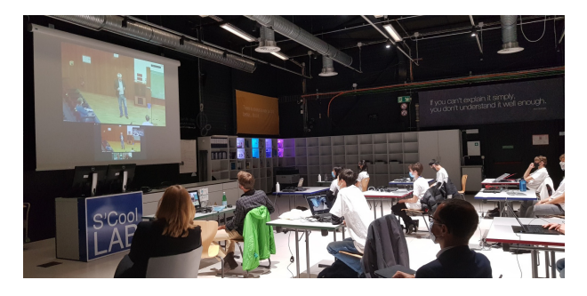
Fig. 4. Set-up of the S'Cool LAB working space, where all the activities of the Swiss Team took place.

Videoconferencing tools had also been used for the execution of the experiment of the Swiss team, while the data to be analyzed was transmitted to the CERN computing infrastructure. The German students were very supportive and tried to learn as much as possible about the Swiss experiment so as to be able to help the other team to the best of their abilities. The Swiss team was very grateful and both teams used different channels to connect with each other — already beforehand, when it was clear that the Swiss team could not travel to DESY. After all, it was the first time in the history of BL4S that one of the winning experiments was done remotely, but successfully in the end.