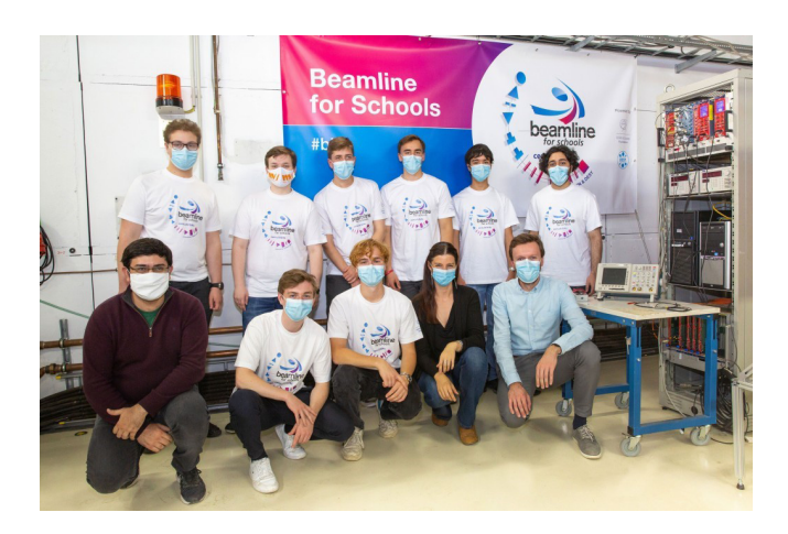
Fig. 5. The German students and members of the BL4S team in the experimental area.

At DESY the risk related to COVID was addressed by the wearing of masks and social distancing in meeting rooms as well as in the experimental area (Fig. 5).