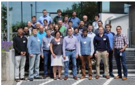
Figure 1: Participants of the Topical Workshop executed in May 2017 at GSI.

The experience and technical solutions from installations all over the world were presented by the experts in the field, with the results extensively discussed and the related contributions serving as a comprehensive catalogue of such systems.