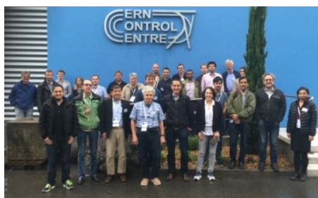
Figure 3: Participants of the Topical Workshop executed in May 2018 at CERN.

A Topical Workshop with 32 participants on ‘ Extracting Information from electro-magnetic monitors in Hadron Accelerators ’ [11] took place in May 2018 at CERN (Geneva, Switzerland) with 32 participants. The goal was to strengthen the collaboration between the beam dynamics and beam instrumentation community as both communities have to contribute to a correct interpretation of advanced beam measurements. Additionally, people working at 3 rd generation light sources participated as the topic is equally important for the electron- and hadron synchrotrons.