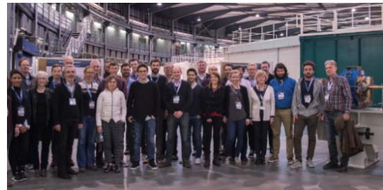
Figure 2: Participants of the Topical Workshop executed in January 2018 at ALBA.

The Topical Workshop ‘ Emittance Measurements for Light Sources and FELs ’ [9] was organized at ALBA (Barcelona, Spain) in January 2018 with 37 participants. The Workshop addressed the challenges that this community is facing with such measurements for the next generation of ultra-low emittance machines. One day was devoted to emittance measurements at synchrotron light sources, and the second day to measurements at Free Electron Lasers. Experts working on emittance measurements for other types of machines such as hadron synchrotrons and Laser Plasma Accelerators were also invited to discuss possible synergies between the different communities. Due to the importance of the topic, a detailed summary of this workshop is given as an invited talk at this conference [10].