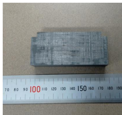
Fig. 1. A picture of a specimen of NITE SiC/SiC for the irradiation test at HiRadMat of CERN