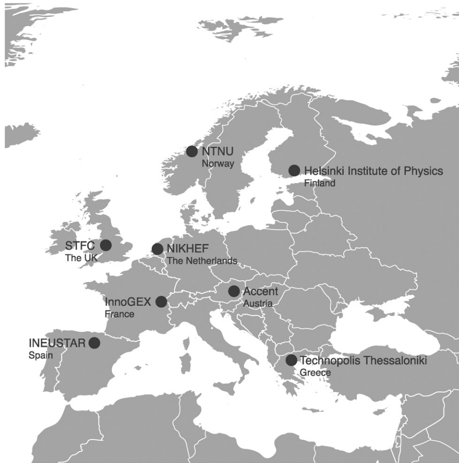
Fig. 3. Map showing the current location of BICs of CERN technologies and the partner organisations.

The total budget for all FP7 projects CERN took part in was 692 million euros, 404 million came from the European Commission and 288 million was matched by the partners. From all of these projects, CERN received in total 111 million euros and provided matching funds of 93 million euros. Perhaps more interesting than the funding itself is the number of partners CERN collaborated with, in total 526. Of these many were universities and other research organisations, but also 73 small and medium size companies and 53 larger companies, indicating that EU projects serve as a useful contact surface between CERN and the private sector.