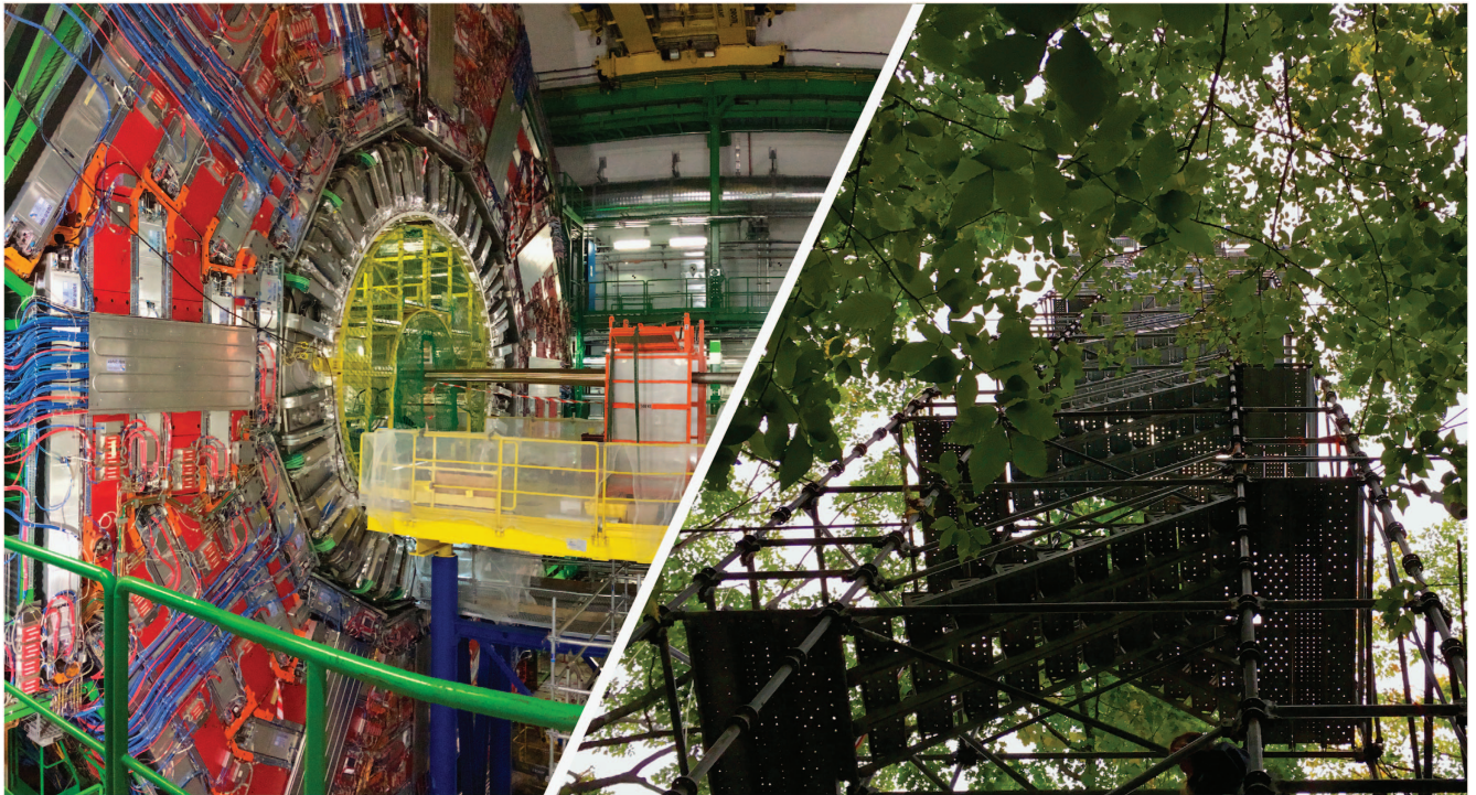
Figure 2. Research teams across the sciences are integrating data provenance methods into their research practices in response to increases in computational demands. On the left: The Compact Muon Solenoid (CMS) experiment at CERN during the technical stop in February 2017. On the right: One of several research towers used for ecological data collection at Harvard Forest. In addition to providing infrastructure for researchers to view the forest at multiple levels in the forest canopy, many instruments for automated observations, such as wind speed, CO 2 flux, and leaf phenology, are placed on these towers. Data are relayed to a controlling computer via a wireless network.

formalized provenance files as a part of their projects. However, this is currently not required nor is it generally done by researchers 22 .