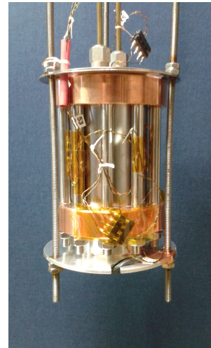
Figure 2: Nb cavity instrumented before the insertion in the LHe cryostat.

We have set-up a reduced scale apparatus to start the evaluation of noise performances of the QUAX detector. A copper cylindrical microwave cavity (resonant frequency 14 GHz) is equipped with a YIG sphere and immersed into a superconducting solenoid. By using a home made ultra stable current generator (at about 30 amps) a 0.5 T field sets the ferromagnetic resonance of the YIG at the cavity resonance frequency. The hybrid modes are then sensed with a critically coupled wire antenna; the antenna output is amplified by an HFET low noise cryogenic pre-amplifier, followed by a room temperature amplifier. The signal is then down converted with a mixer and sampled with a 2 MHz fast ADC. We effectively measure a 1 MHz window centered at one of the two resonant hybrid modes of the system cavity plus YIG. The cavity, the magnet and the pre-amplifier are housed inside a liquid helium cryostat and the working temperature is about 5 K. We have seen that the rms noise coincides with the expected value due to the thermal background, indicating that no extra noise is added by the material. After integration for about an hour, the analysis of the power fluctuations gave us the limit sensitivity of about 10^{-22} W. For the current configuration this correspond to a limit in the axion effective magnetic field of about 10^{-16} T.