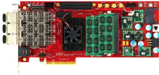
Figure 1: C-RORC