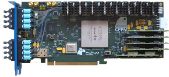
Figure 2: CRU