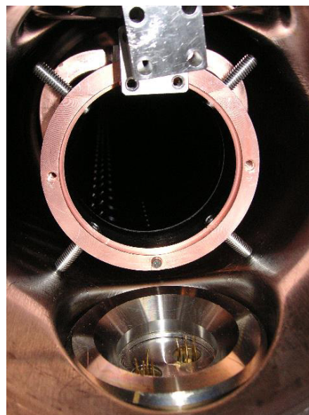
Figure 1: Picture of the a-C coated beam screen during re-installation on February 2014.

intercept straight electron paths to the CB. The BS is equipped with two 0.1 mm thin copper coated cold-to-warm transitions (CWTs) at its extremities. RF continuity is assured with RF fingers. The final adaptations to the upstream and downstream ID 100 mm chambers are tapered with conical apertures of 45°. Total pressure is measured at these two warm locations, i.e. upstream and downstream the BS, via calibrated Bayard-Alpert (VGI) hot cathode and Penning (VGHB) cold cathode ionization gauges.