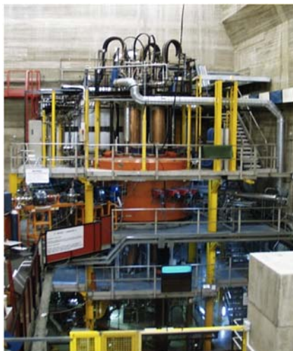
Fig.2: A view of K800 Superconducting Cyclotron at Laboratori Nazionali del Sud in Catania.

For the spectrometer the main foreseen upgrades are: