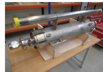
XFEL series cavity during incoming inspection at DESY.

Keywords: CRISP, SRF, European XFEL, cryomodule cavities