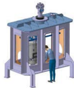
Fig 2: Cryostat integrating a quarter-wave resonator.