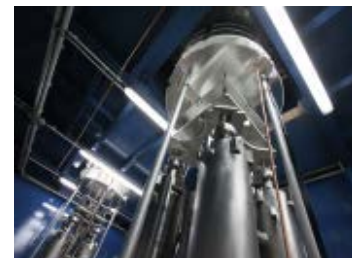
Vertical test inserts equipped with XFEL superconducting accelerator series cavities.