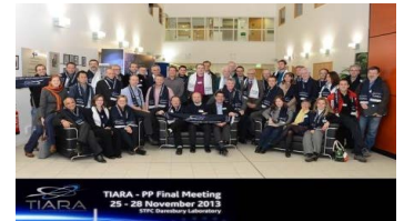
The final general meeting of the TIARA Preparatory Phase was hosted by STFC at Daresbury Laboratory on November 25-28.

To mark the approval of the High Luminosity LHC Programme