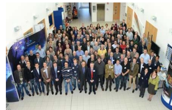
Group picture from the 3rd Joint HiLumi LHC-LARP Annual Meeting 2013.

Keywords: TIARA, education, training, recommendations