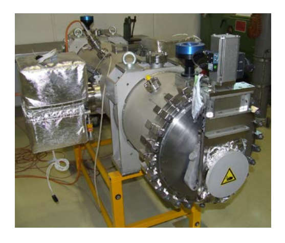
Figure 2: New distributor ready for installation.

In the injection line notably the system employed to split up the incoming beam into the planes of the four Booster rings is being rebuilt. This system consists of the distributor, a system of five pulsed magnets, which give an initial deflection to the beam slices destined to the different rings, followed by a vertical septum, which further increases the deflection angle. Both devices will be replaced by new ones that can operate at 160 MeV beam energy. The hardware is presently under construction at CERN. Figure 2 shows the new distributor ready for installation.