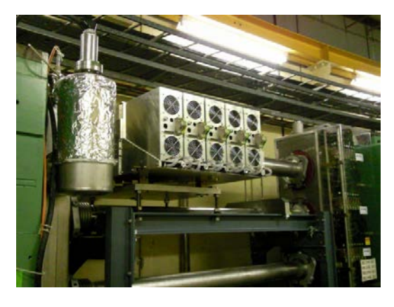
Figure 1: Prototype wideband cavity cells installed in Ring 4 of the PSB.