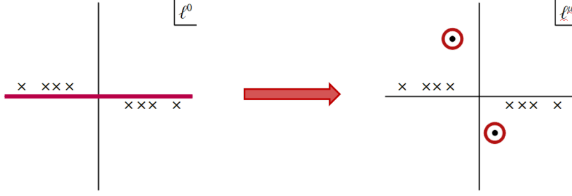
Figure 2: Cutting as contour replacement

the simultaneous solutions to eqs. (4.3), in \mathbb{C}^4 . The contour in the case of the one-loop box is a product of four circles, that is a four-torus T^4 . The replacement is illustrated schematically in fig. 2, with contours \mathcal{C}_{1,2} encircling the two global poles. We stress that this is not a contour deformation leaving the value of the integral unchanged; it is a replacement, changing the value of the integral and ultimately allows us to derive an equation for the coefficient of the one-loop box.