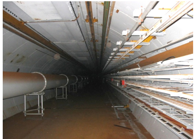
Figure 1: WANF before dismantling.

A comprehensive inventory of equipment and associated environmental conditions was issued and comprised: TAX blocks, magnets, collimators, T9 target, WANF horn & reflector, strip-lines, 100m-long Helium tubes and the infrastructure (cables, cooling circuit, air duct, shielding). After 11 years of decay without ventilation and due to the oxidation by ozone, a lot of activated dust covered all the equipment.