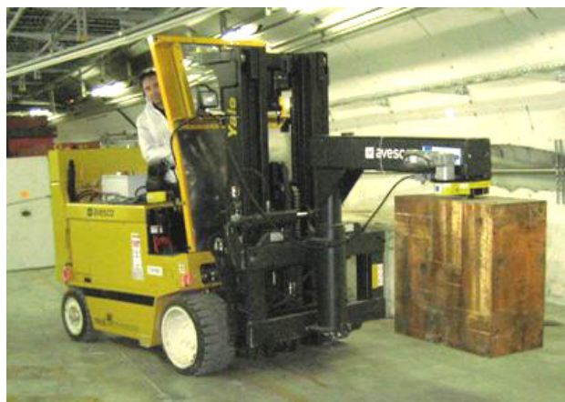
Figure 2: Shielded Forklift equipped with automatic hook.