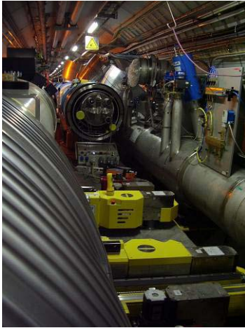
Figure 2: SSS with jumper transferred by the transfer tables between two cryo-dipoles

A Transfer Equipment Set TES (ZTS VVU Kosice, Slovakia) composed of two transfer tables is then positioned under the magnet. The modular transfer tables which use stepper motors and harmonic drives handle the magnets with six degrees of freedom and high precision (0.1 mm). The TES lifts the cryo-magnet from the UE and automatically aligns the magnet with the magnet support jacks. After removal of the UE, the magnet is transferred following a predefined horizontal trajectory to pass the adjacent magnet interconnects and is then lowered onto the support jacks.