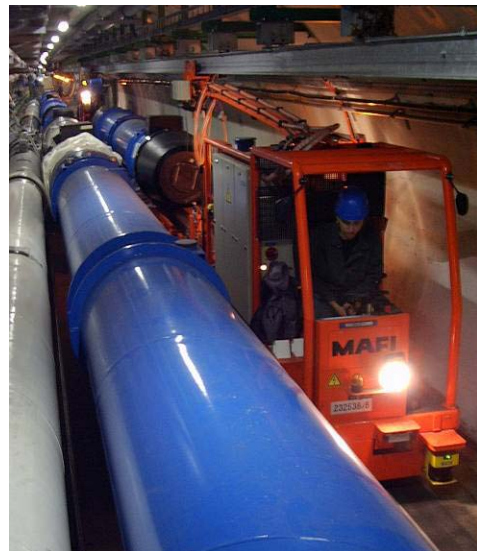
Figure 1: Limited space for the magnet transport in the LHC tunnel

The main dipoles and quadrupoles for the arcs and the dispersion suppressors are lowered via the only access shaft large enough for the dipoles, onto the tunnel vehicles (BNN/MAFI, Germany) that transport the magnets to the installation point. The magnets are transported on a trailer or Magnet Transport Unit (MTU) that is connected at both ends to an Operator Transport Unit OTU. There are six such tunnel vehicles; four MTU for main cryo-dipoles, two of which are modified to be able to also transport LSS magnets (explained later). Two MTU are built to transport the main quadrupole cryo-magnets (SSS) and have three different support positions for the SSS arc, Q8, Q10, Q11 and finally Q9 of the dispersion suppressors that are longer than the SSS in the arc. The automatic, optically guided, hydraulic vehicles transport the magnets to the point of installation through the transfer tunnel, the 27 km long LHC ring and the bypass galleries around the experimental caverns. The speed of the loaded vehicles (total weight up to 54 t) is 3 km/h with most of the time not more than 10 cm clearance at the sides.