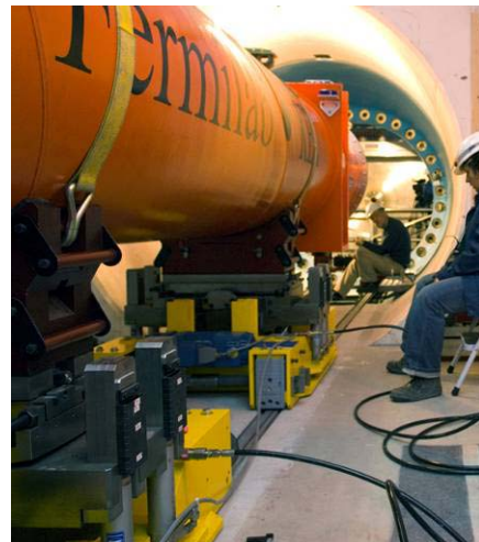
Figure 4: Q1 is moved with the motorised bogies into the ATLAS experimental radiation shielding

Additional equipment is used for some of the low- \beta quadrupoles Q1 and Q2 that are installed in very confined dead-end tunnels through tunnel radiation shielding walls and even inside the forward experimental radiation shielding.