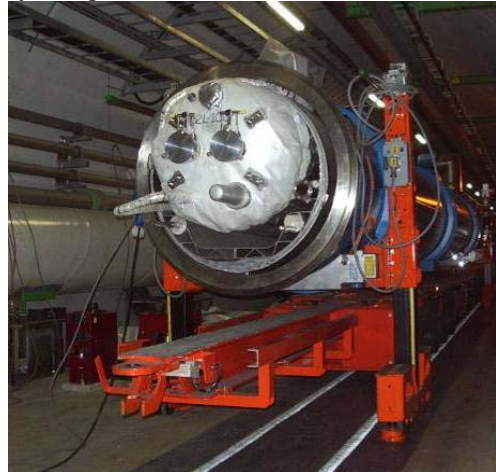
Figure 3: MUE assembled around a magnet lifted off the trailer

wheels by the operators and they are tightly fitted on the MUE cradle. Once the MUE legs are firmly put on the ground, two MUE can lift a 24 t magnet. An inclinometer synchronises the two legs of an MUE. After the trailer is removed, the procedure becomes similar to the procedure for the magnets in the arc. Although the assembly of the lifting equipment around the magnet seems more cumbersome, well trained operators can carry out an LSS installation in about two hours, practically the same time as the cryo-magnets in the arc.