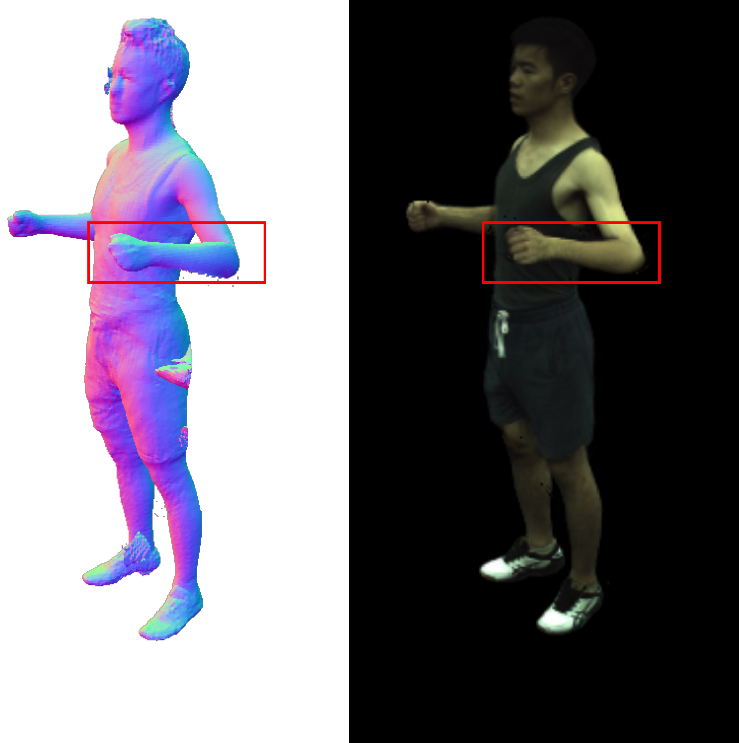
(a) w/o S_{base}