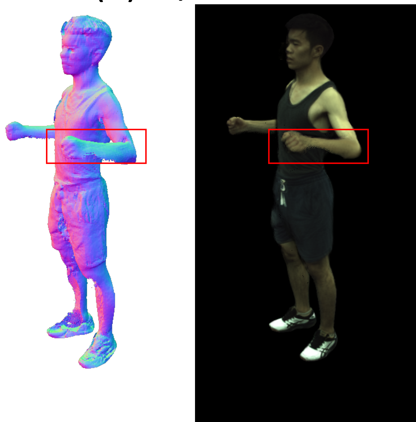
(d) w/o IBD