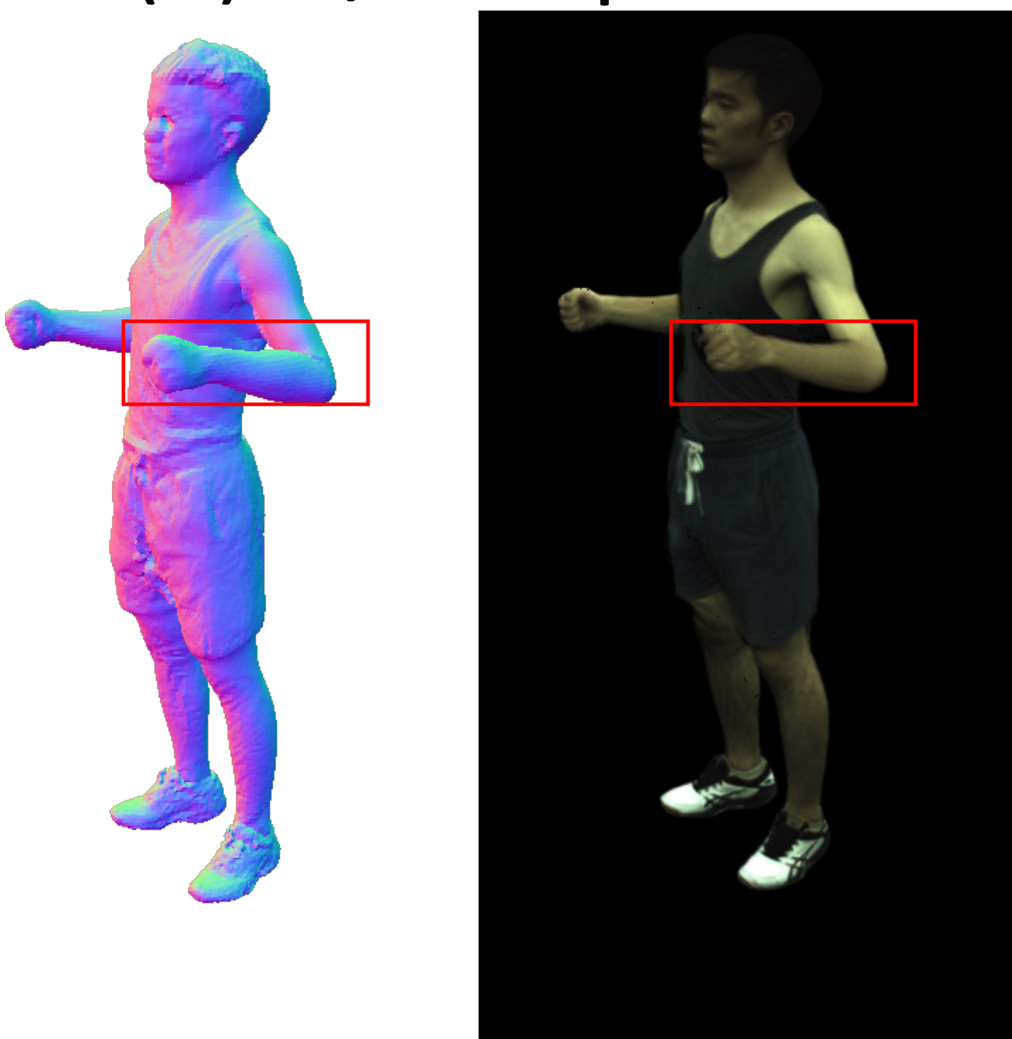
(e) full model