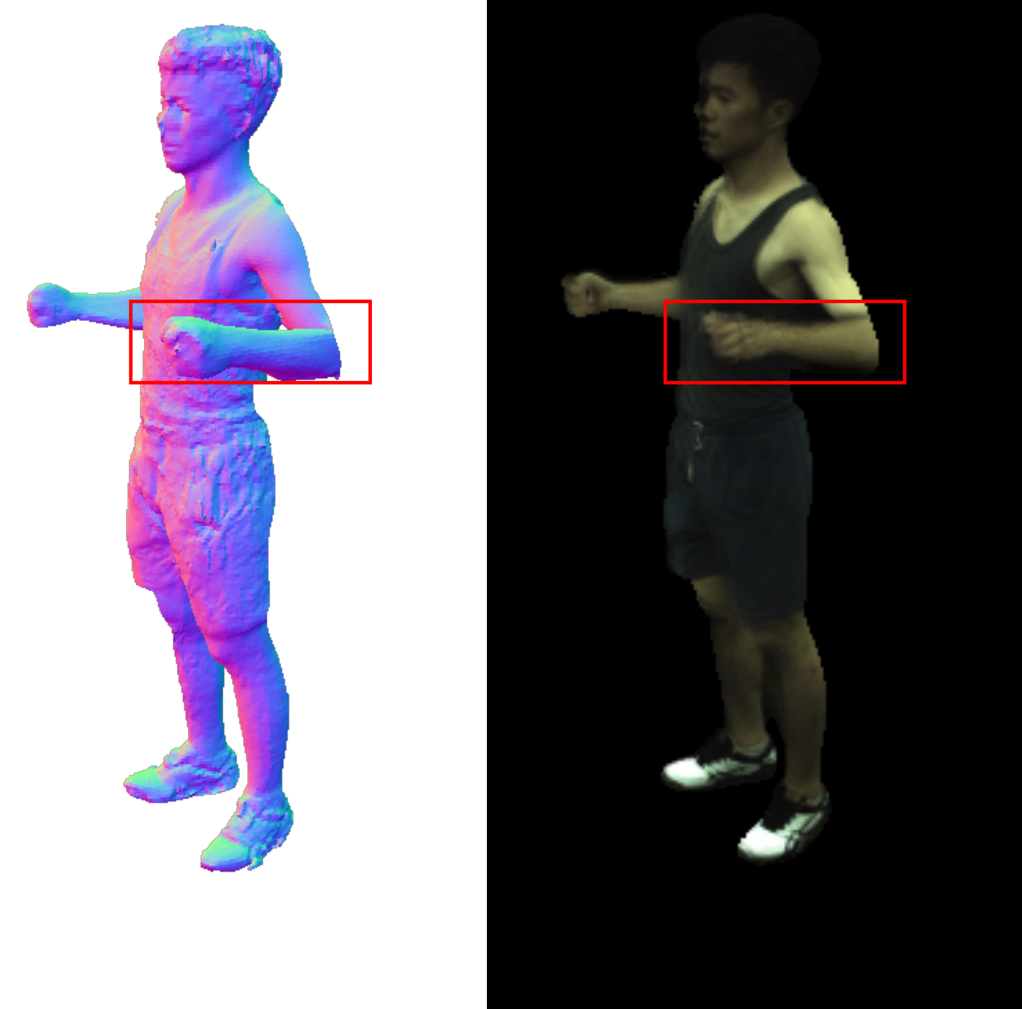
(c) w/o PGS