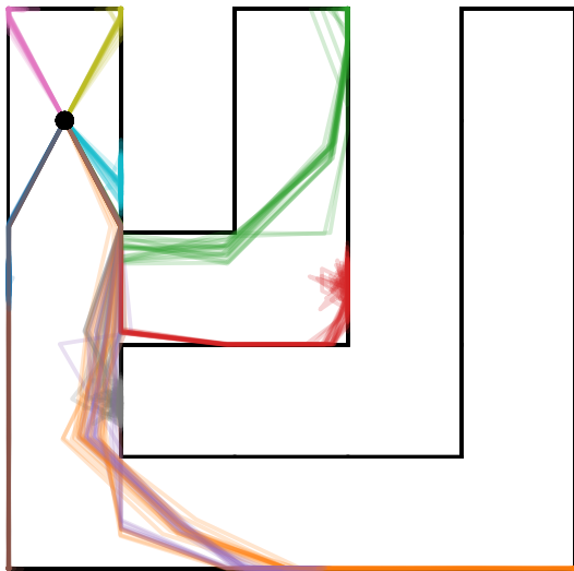
H(S) - H(S | Z)