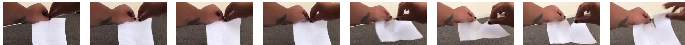
GT: Tearing something just a little bit

ImageNet-21k sup. pred: Folding something (✓), VideoMAE pred: Closing something (✗)