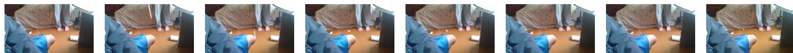
GT: Something falling like a rock

ImageMAE pred: Something falling like a rock (✓), VideoMAE pred: Throwing something (✗)