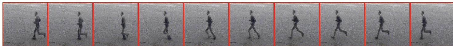
TAI (input 2 frames)