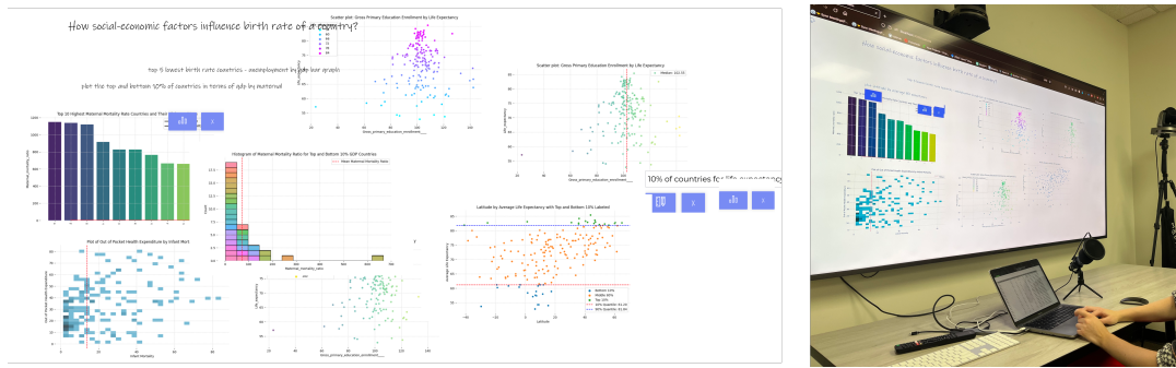
Figure 4: Study 3 on complex and interdependent tasks - data analysis results in design-like canvas environment: results (left) and study setting (right).