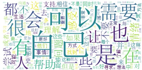
Figure 4: Word cloud map of psychological consultants' utterances (English version: Appendix D).

not publicly available due to the privacy protection and ethical standards of psychological counseling. To construct high-quality multi-turn empathy conversation dataset, We selected 12 topics of psychological counseling to construct 215,813 long-text questions and 619,725 long-text answer through crowdsourcing. The distribution of topics is shown in Figure 3. Then, we used ChatGPT (99% called gpt-3.5-turbo api and 1% called gpt-4 api) as a text rewriting tool following the prompt as shown in Figure 2 to convert single-turn psychological counseling conversations to multi-turn empathy conversations, in which one turn is in the form of "用户: <user_utt>\n心理咨询师: <psy_utt>". The response of "心理咨询师" was asked to be rewritten to reflect human-centered expressions such as empathy, listening, comfort, etc. Finally, after manual proofreading, we removed 105,134 low-quality samples and ultimately obtained 2,300,248 samples. As shown in Figure 4, the word cloud map of the utterances expressed by psychological consultants indicated that the rewritten multi-turn empathy conversation has high level of empathy.