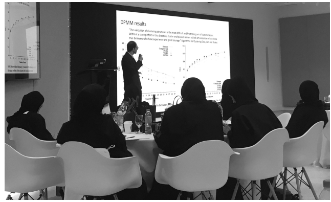
Figure 2: A course tutor delivering a lecture on unsupervised learning for electricity analytics and showing a clustering example based on work by University of Oxford researchers, in Dubai, UAE, January 2020.

During each teaching week, lectures were generally delivered in the mornings within 90-minute time boxes. Each lecture consists of presentations, discussions and thought exercises. As part of the shape of the day, in the mornings we split up the more difficult technical content for our students by having one non-technical plenary (marked as P n in Table 1) followed by a technical plenary (marked as TP n in Table 1) on any given day. The theory presented in these morning