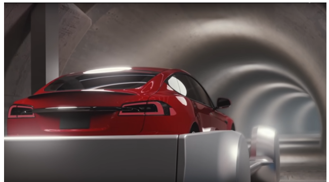
Fig. 1: Snapshot from the vision video of The Boring Company

The case is represented by The Boring Company 1 . This company has the mission to solve traffic issues by creating safe, fast-to-build, and cost-effective transportation, utility, and freight tunnels. On April 28, 2017, The Boring Company released an animated video 2 on their vision to solve the traffic problems in cities by building large networks of tunnels underneath them. This vision video is the unit of analysis. The video shows a car that uses a network of tunnels underneath a city to travel from one location to another (see Fig. 1).