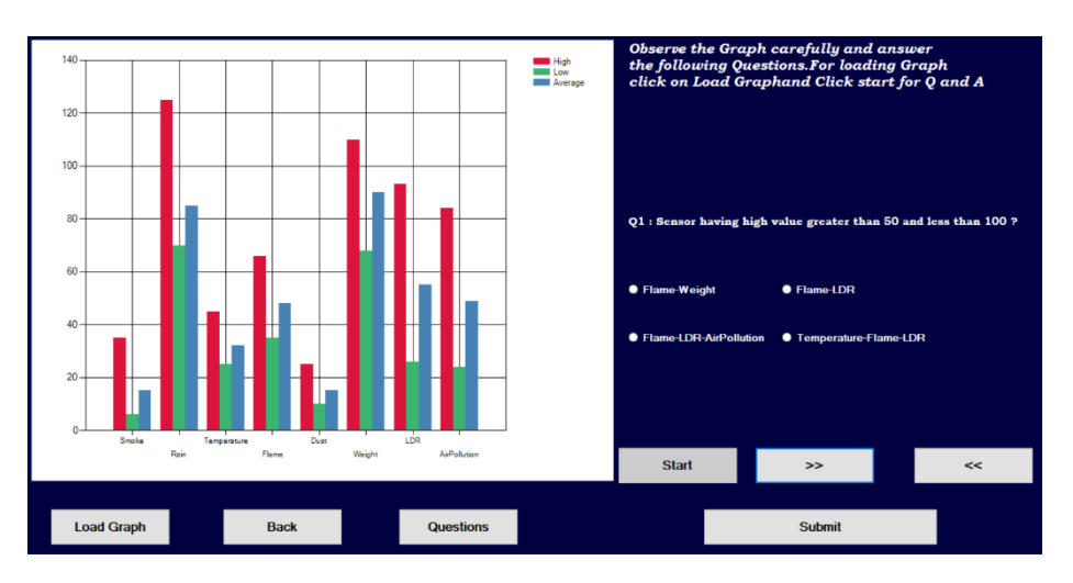
Fig. 1. Software interface showing graphical and question/answer portion

Design: A software which consisted four basic visualization techniques and five set of questions with multiple choice answers was developed. An eye gaze tracker was placed at the bottom of the screen. Participants were asked to seat at 75 cm away from the screen. They were instructed to answer a set of questions by investigating the graph. Figure 1 below shows a sample interface of the system. Bar graph, line graph, radar graph and area graph were considered for the study.