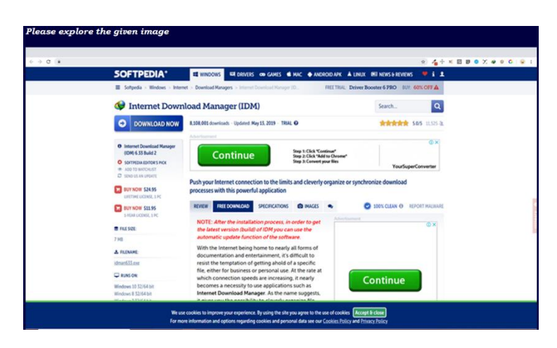
Fig 2: Example of website with visual manipulation