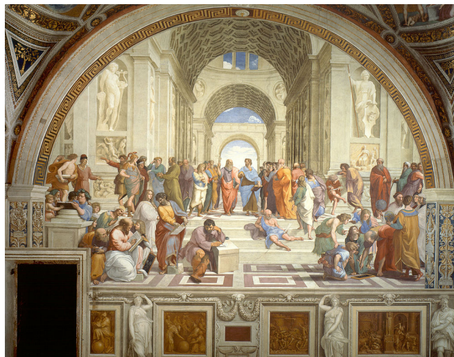
Figure 1: The School of Athens

To put it in the history of fundamental dynamics: in the previous century one talks about Nuclear Physics (NP) and HEP; then flavor dynamics was part of HEP. Now this century the landscape has changed very much: one talks about NP and Middle Energy Physics (MEP) and HEP. The tools of HEP apply to jets, Higgs forces, top quarks, direct SUSY etc.; when one analyses the decays of strange, beauty & charm hadrons, one uses Dalitz plots, dispersion relations etc. and the goal is to go for accuracy or even precision. We need New Alliance between MEP & HEP. One can 'paint' the landscape as an analogy with the School of Athens, see Fig.1. In the centre one sees 'Plato' pointing 'up' – thus HEP – while 'Aristotle' with one hand going forward shows much 'balance' with the other hand – thus MEP.