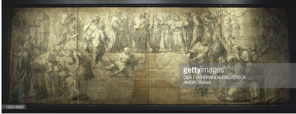
Figure 3: Draft of the ‘School of Athens’