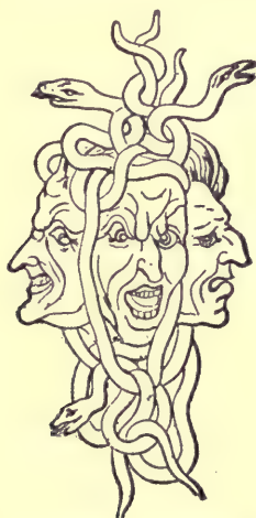
An orthodox "state of mind"

A man capable of being happy in such employment, could of course take great delight in reading even the genealogies of the Old Testament. It is very easy to see what a glow of joy would naturally overspread the face of an angel while reading the history of the Jewish wars, how the seraphim and cherubim would clasp their rosy palms in ecstasy over the fate of Korah and his company, and what laughter would wake the echoes of the New Jerusalem as some one told again the story of the children and the bears ; and what happy groups, with folded pinions, would smilingly listen to the 109th Psalm.