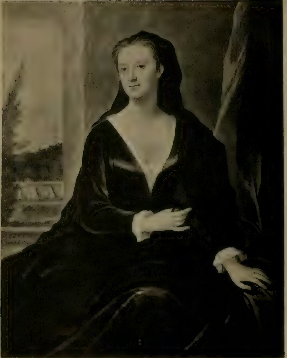
LADY GRISELL BAILLIE,