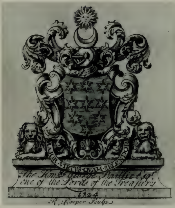
BOOK PLATE OF GEORGE BAILLIE OF JERVISWOOD.