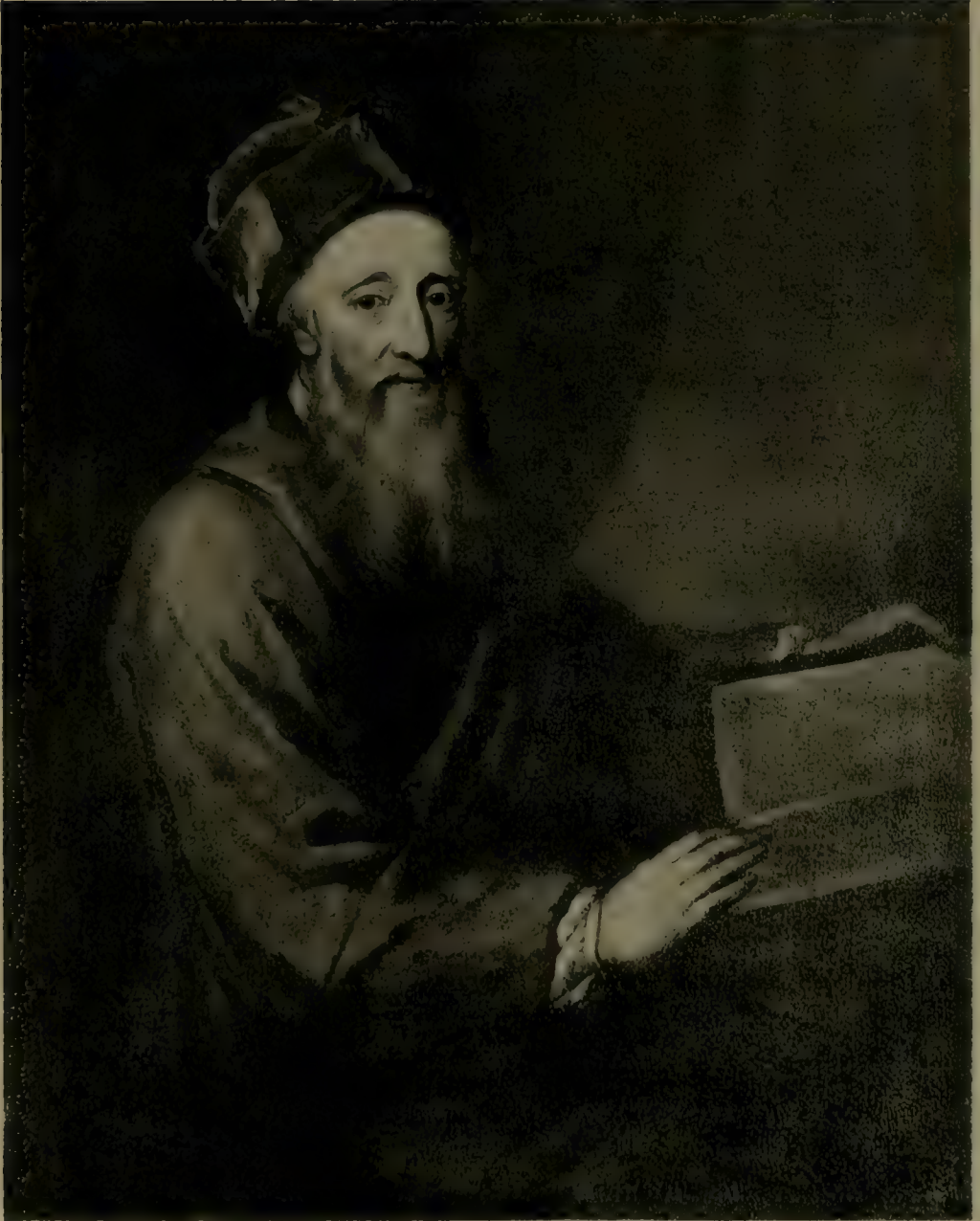
THE RIGHT HON. PATRICK HUME, EARL OF MARCHMONT.