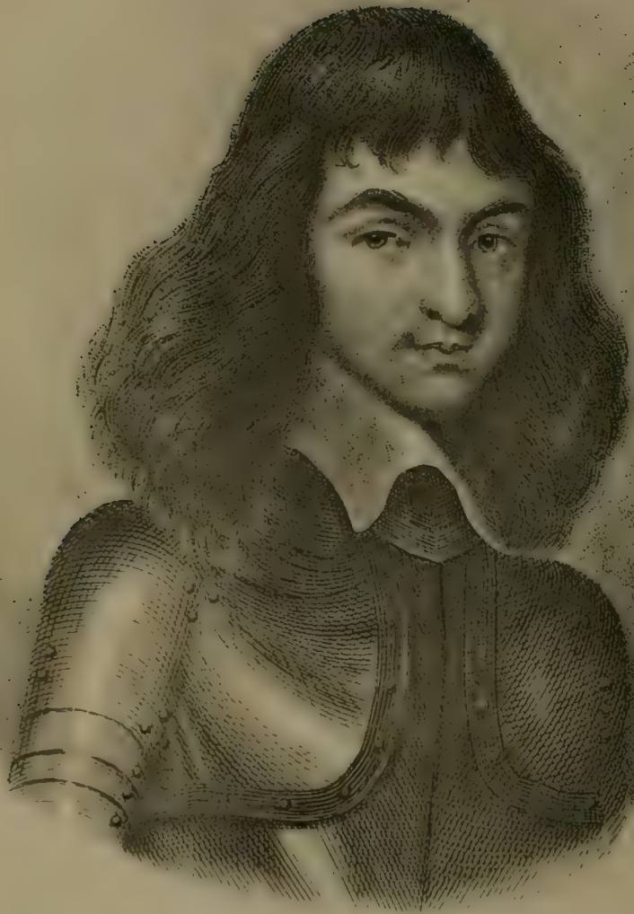
ROBERT BAILLIE OF JERVISWOOD.