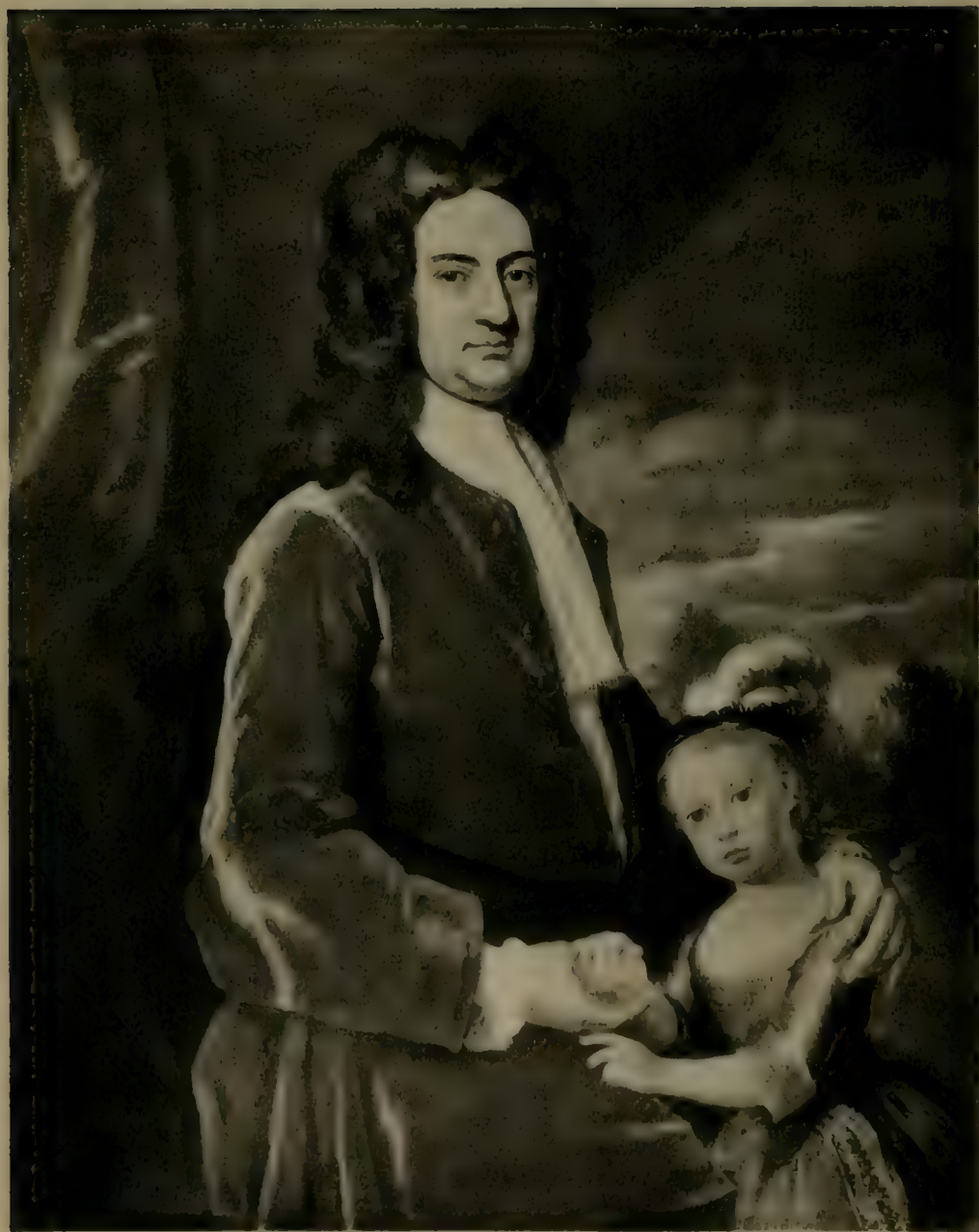
GEORGE BAILLIE OF JERVISWOOD AND HIS DAUGHTER GRISELL.