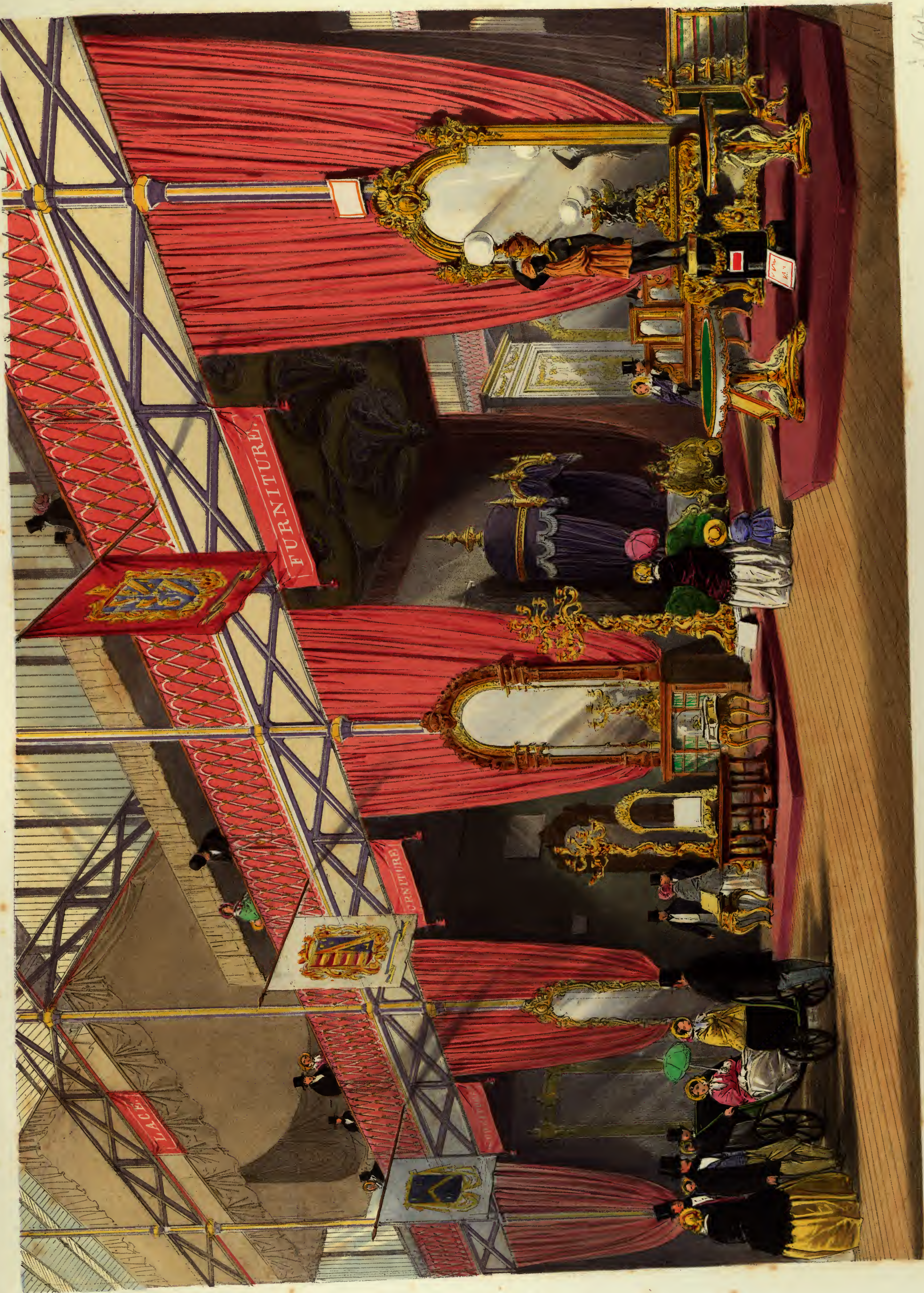
Illustration of the Exhibition of 1854