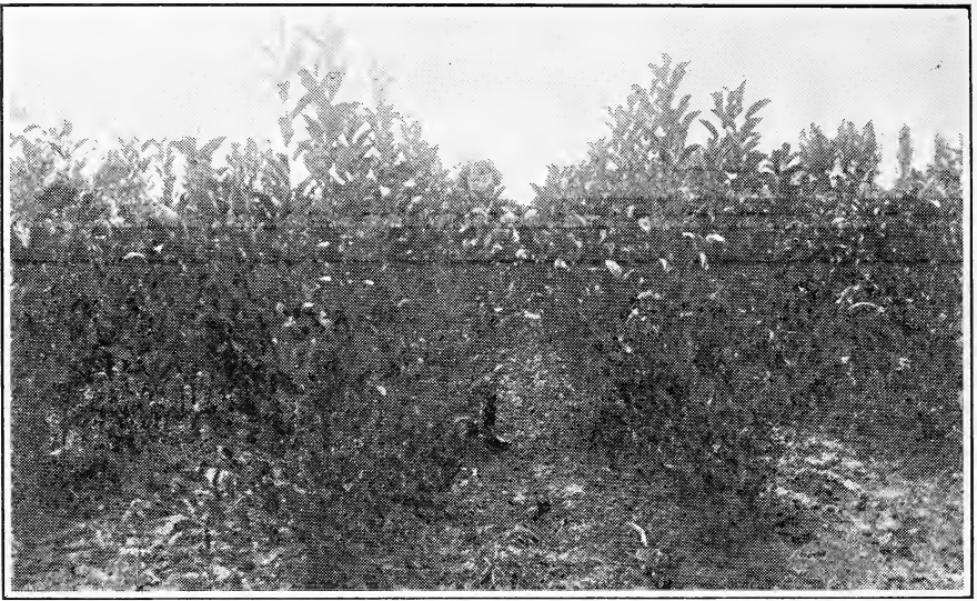
One year Cherry Trees in Our Nursery, Photographed August 25th