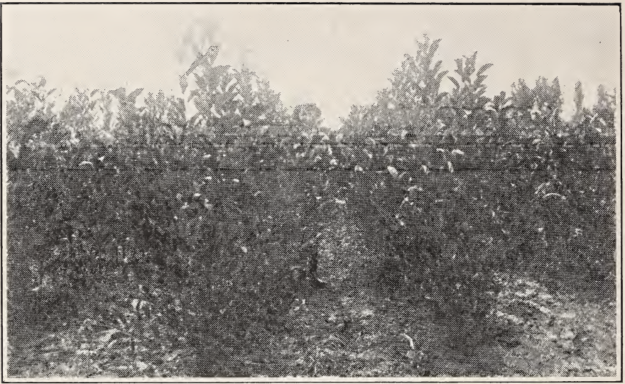
One year Cherry Trees in Our Nursery, Photographed August 25th