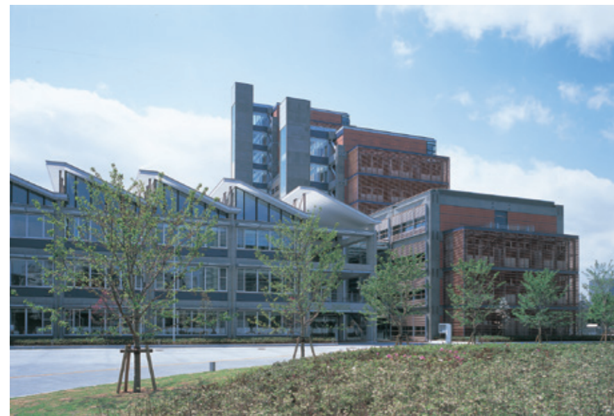
The GRIPS campus, Roppongi, Tokyo.

7-22-1 Roppongi, Minato-Ku, Tokyo, 106-8677, Japan E-mail: jims@grips.ac.jp Fax: +81-3-6439-6030 http://www.grips.ac.jp/jims/