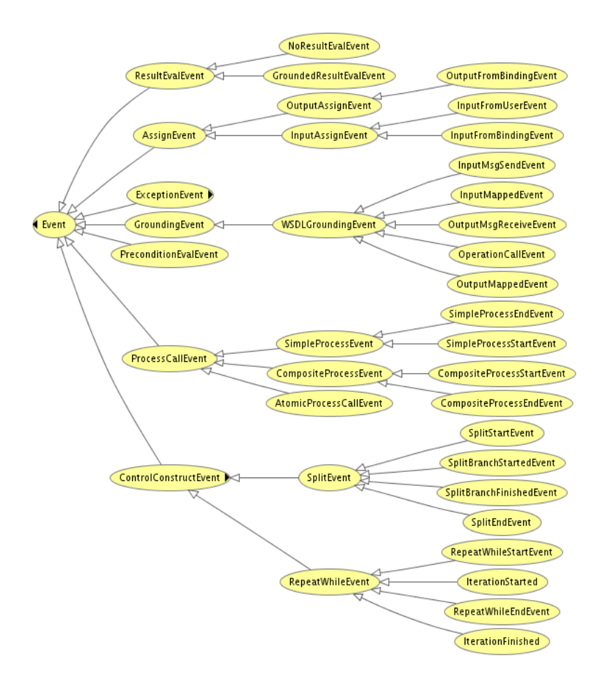
Fig. 1. Event types taxonomy. Only selected classes are displayed, particularly, specific ExceptionEvent types are not shown (see Section 4) and only some ControlConstructEvent types are shown.

It is important to note that described event types are application in dependent in two senses. First, they are derived only from the logic of the process model and therefore can be used in any application. Second, they are neutral to the purpose for which they can be used. So, for example, it is easy to imagine, that if the OVM emitted described events during the process model execution, they could be used for generating logs. If a different monitoring task needs to be performed as, e.g., performance analysis, the events could be used as well. Thanks to the application independence, the described events can serve as a sound basis for the mon-