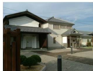
“Murakami Heritage Center”

Address : 7-17, Sannomachi, Murakami-shi, Niigata Open : 9:00am - 4:30pm *Closed on 29 Dec. - 4.Jan. Admission : Adult/JP¥200, Child/JP¥100, JNT member/Free Tel : 0254-53-3666