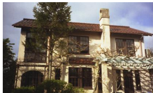
“Dr. Komai's Residence”

J.N.T. has received the western building with