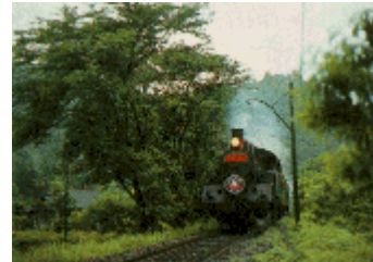
"The Trust Train"

The historic steam locomotive train, carrier of industrial heritage. It runs five times a year under Oigawa Railway Co. A member has to buy a ticket on board.