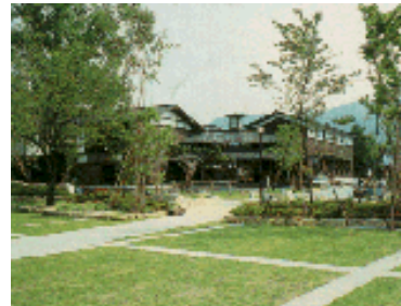
“Hidano Takumi Heritage Center”

Address : 10-1, Ichinomachi, Furukawa-cho, Hida-shi, Gifu Open : Mar. - Nov.: 9:00am - 5:00pm Dec. - Feb.: 9:00am - 4:30pm *Closed on Thursdays, 28 Dec. - 5 Jan. Admission : Adult/JP¥300, Child/JP¥100, JNT member/Free Tel : 0577-73-3321