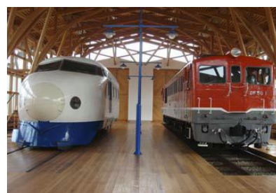
“ Shikoku Railway Heritage Center”

It is for introduction of local history and culture in the Railway of Shikoku Area with display actual models. On the site the memorial hall was constructed in 2007 for the preservation of Shinkansen "0 system" that are the first type of Shinkansen train and "the DF50 form electricity type diesel".