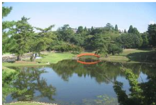
“Old Daijoin Temple Garden”

One of the oldest Japanese gardens, created in the 12th-century, was restored in 1973 by the J.N.T. The garden is located in the northeast of the old capital, Nara-city, and in the area around the garden there are a lot of wooden houses dating from medieval time. This area is called “Nara-Machi”.