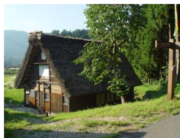
“Shirakawago Gassho style Heritage Center”

Visitors are able to learn about the way of traditional life in Shirakawa village. The historical house is now open to the public in summer season.