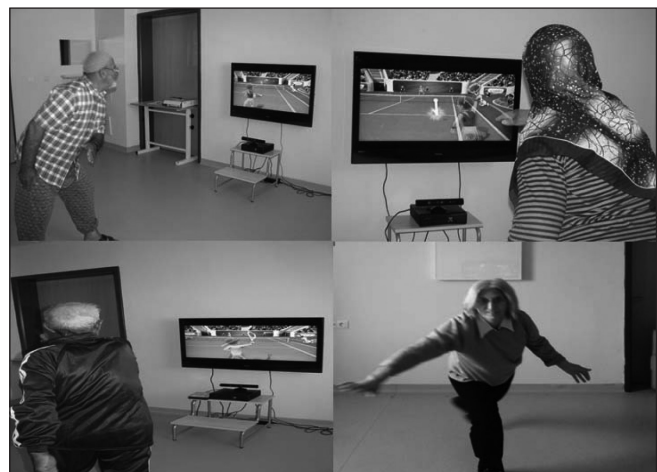
Fig. 2. Participants while exergaming.