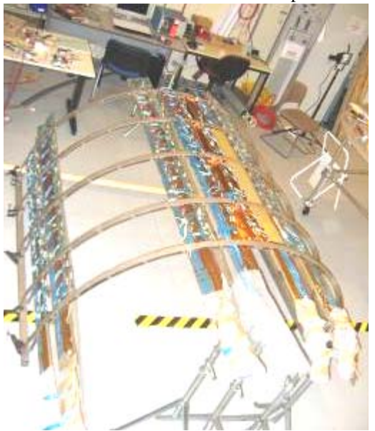
Figure 4:Cable trays inserted into squirrel cage, which goes over the TRT End-Cap wheels.

Acceptance tests at different steps of the process are essential.