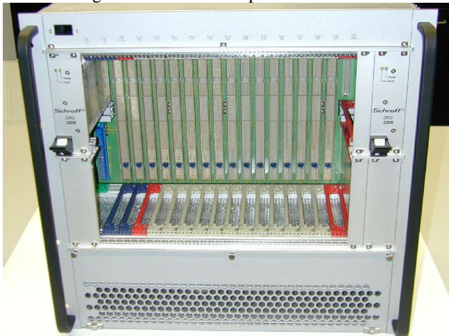
Figure 1: Photograph of a Schroff Advanced TCA crate.

It seems probable that a newer architecture such as the recently developed AdvancedTCA (ATCA) [16] will be a better platform. ATCA “front boards” have a 6HP wide front panel ( 1.5 times as wide as a VME module ) and have a 8U x 280mm form factor. Power is distributed at 48V with DC-DC converters on the modules. There are a number of defined backplane architectures, implemented using Tyco “Zpack HM-ZD” connectors[17] which with careful backplane design are capable of transmitting data at 10Gbit/s per pair. Set-up and control is handled by a single 10/100/1000base-T Ethernet link to each module, taking up 2mm of vertical backplane space, compared to 90mm for a VME J1 connector. Figure 1 show an example of a ATCA crate.