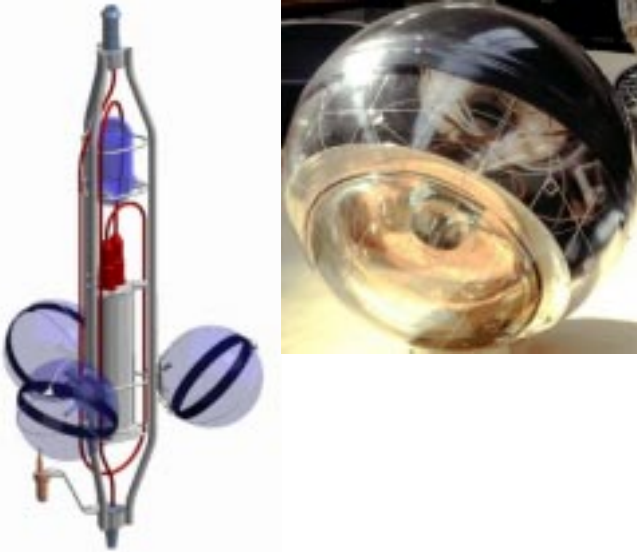
Figure 1. Left: A storey of a string with the three OMs supported by a titanium frame. The cylindrical container for the electronic components (bottom) and an optical beacon (top) are located inside the frame. Right: An optical module. The metal grid inside the sphere is a mu metal cage shielding the PMT against the Earth magnetic field.

the arrival times of the photons at the PMTs and the OM positions (known to about 5 cm), the trajectory of muons can be determined with a pointing precision of about 0.2 - 0.3^\circ , which is the dominant contribution to the experimental uncertainty on the neutrino direction for neutrino energies E_\nu \gtrsim 10 TeV. The muon energy, E_\mu , is determined from the muon range at small energies and from the Čerenkov intensity due to radiative energy losses at high energies. In the latter case, the RMS resolution on \log E_\mu is 0.2 - 0.3 .