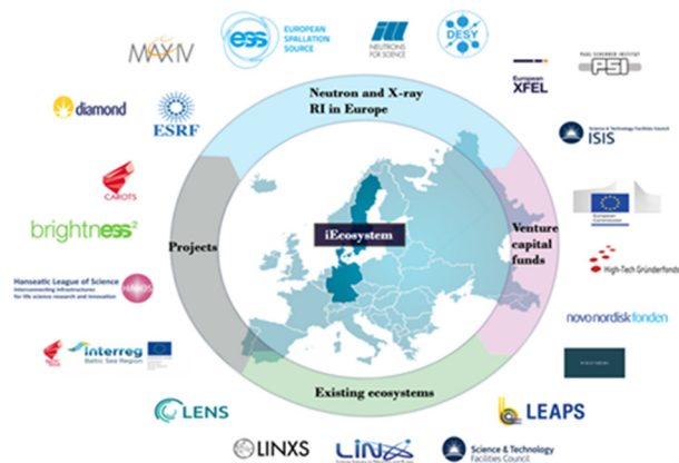
Figure 2: Specific innovative ecosystem

Figure 2 shows an example of the synergies between 4 main stakeholder groups, that together empower solution driven and results focused execution of projects. Innovative ecosystems like these, enable science for society. Existing ecosystems, such as LINXS (swedish) [10], LEAPS [11], CERIC [12], EIROforum [13], LENS [14] or LINX (danish) [15], revive forum and communication with research and industrial communities, policymakers, EC administration and other RIs' stakeholders. Venture capital funds beyond traditional project funding are crucial to realize and execute the commercial value and impact.