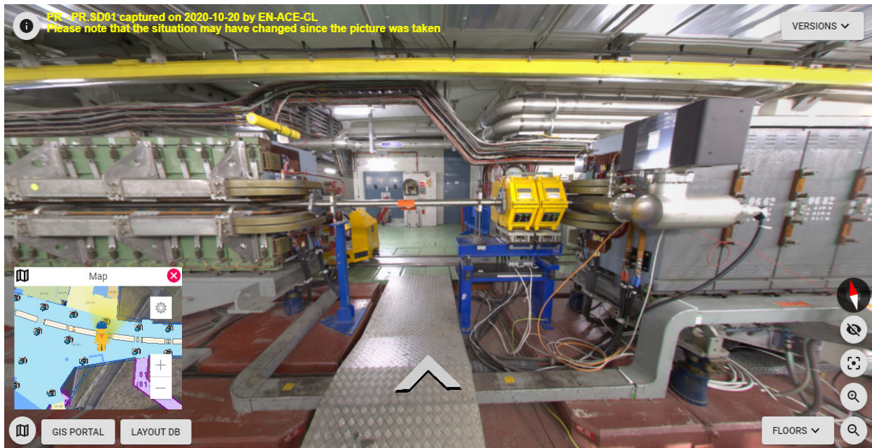
Figure 1: Panorama application interface, showing a panorama from region PR.SD01 of the PS Ring taken during LS2.