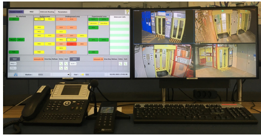
Figure 3: LACS operator interface. Access point controls are on the left and video feeds of the selected access points on the right.