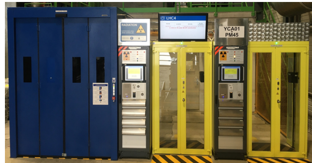
Figure 2: LHC access point with MAD and two PADs.

zone unaccounted. A double LHC access point is shown in Fig. 2.