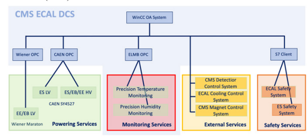
Figure 1: ECAL Detector Control System (DCS) architecture including its connection with other services. Inspired by [5].

S7 protocols for hardware communication are used. As part of such ECAL DCS migration described in this paper, the OPC DA servers have been migrated to OPC Unified Architecture (UA) servers.