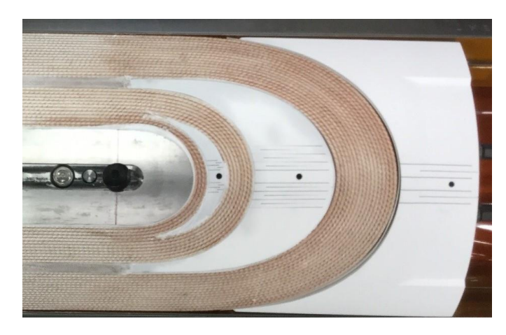
Fig. 1. Photo of an MQXF return end after coil winding and curing. The white component on the right is the saddle, and the other two white parts are end spacers. These parts are white because they are plasma coated using Al<sub>2</sub>O<sub>3</sub> powder to improve electrical insulation. They have slits for allowing some flexibility during winding. On the left there is the tip of the coil pole made of Ti-6Al-4V.

A few prototype coils failed the coil-saddle Hipot at 1 kV that is performed after coil fabrication is complete. Coil QXFA109 showed some anomalies when an impulse test was performed at 2.5 kV after coil-pad subassembly. Subsequent electrical tests allowed locating the electrical weakness (between the coil and the saddle in the return-end inner-layer) and further degraded the dielectric strength between these components. The saddles (also known as "end shoes") are the structural parts in contact with coil outermost turn at each end (Fig 1). They are