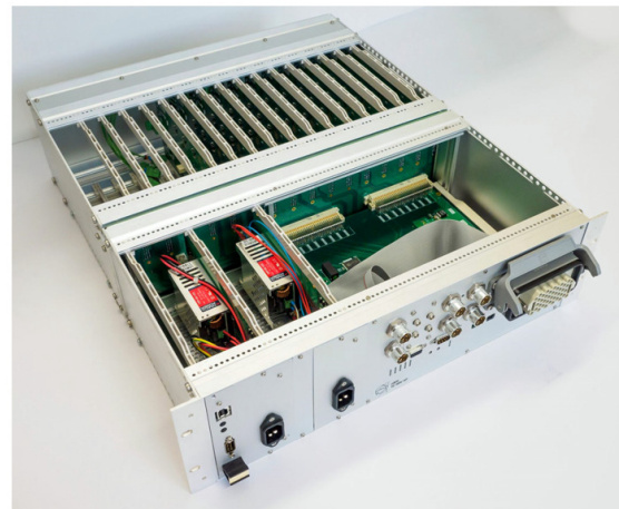
Figure 1: UQDS v2.1 crate serving as the base line prototype for the HL-LHC quench detection system.

set of two independent units reading signals from two redundant sets of instrumentation voltage taps. Each unit is powered by two independent power supply units, which are supplied by different uninterruptible power supply (UPS) 230 V AC feeds. The UQDS units are equipped with configurable hardware interlocks for the power abort signal and the activation of the protection elements of the magnet circuit such as quench heater discharge power supplies (DQHDS), Coupling Loss Induced Quench units (CLIQ) [3] and energy extraction systems. The built-in field-bus interface, either of the WORLDVIP™ or the POWERLINK™ standard, provides the data link to the front-end computers of the accelerator control system.