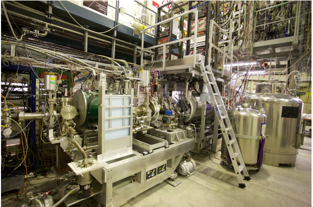
FIG. 1. The ALPHA-2 apparatus. The catching trap is on the antiproton beam line entering from the AD from the left. The main atom trap is located under the ladder-accessible platform which houses electronics for the annihilation vertex detector. The large dewar to the right of the atom trap contains liquid helium used to cool down the atom trap. The positron accumulator is on the beamline on the far right side of the atom trap, but is obscured by the dewars in this picture.

in a process referred to as mixing while a minimum B-field magnetic trap is energised. Antihydrogen is formed in a three-body recombination process and anti-atoms with lower kinetic energy than the trap depth of 0.5 K remain confined by interactions of their magnetic moment and the inhomogeneous field of the magnetic trap. Details of the synthesis process and trapping can be found e.g. in [17]. Briefly, around 100,000 antiprotons and 2,000,000 positrons yield about 30,000 antihydrogen atoms per mixing attempt. Out of these, up to 20 are trapped in one production cycle which lasts 4 min. The antihydrogen atoms form in an excited state, but decay rapidly to one of the four hyperfine states of the ground state manifold, labelled a , b , c and d with increasing energy, see figure 2. Of these four states c and d have the correct magnetic moment to become trapped.