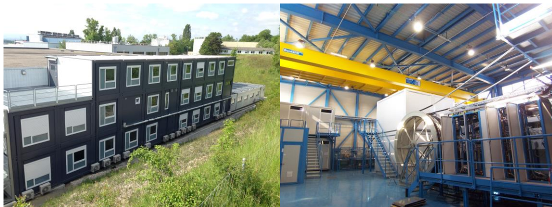
Fig. 1: The two new buildings erected in the AD complex.

Two new buildings have been erected at CERN in the framework of the AD complex development: building 93 is now the home of the experiments control rooms, with adapted facilities (meeting room, cafeteria etc.), and building 393 houses a shared cleaning room and storage space for all experiments, in addition to a shared mechanical workshop and the AD/ELENA kicker generators. These buildings are now completely finished and operational (see Fig.1).