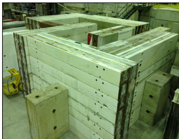
Fig. 3: GBAR LINAC bunker assembly in AD hall (May 2016).

Ground floor has been cleared for the GBAR experiment and in particular for its positron LINAC. When in operation at full repetition rate, the 10 MeV GBAR electron LINAC beam hitting the tungsten target generates radiation levels of 3 \cdot 10^3 Sv/h at 1 m distance from the target and a contact dose up to 10^6 Sv/h. This requires the installation of a massive bunker to attenuate radiations. Economical constraints have been integrated by recycling about 1000 tons of former LEP (Large Electron Positron collider) magnet yokes for this shielding (see Fig.3). The impact of this huge mass, only 5 m away from the AD machine (currently in operation), is being monitored online and has remained well within acceptable limits to date, with a sink smaller than 150 \mu\text{m} , measured on AD quadrupoles.