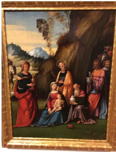
Figure 1: Painting of 'Epiphany' in a museum in Krakow

I have truly enjoyed the 2018 Epiphany Conference in Krakow, learnt about fundamental dynamics – and the 'landscapes' of history & art on the true European scale. Very special event happened on January 6 long time ago (see the Figure 1 ): three sages came to meet with the Christ child.