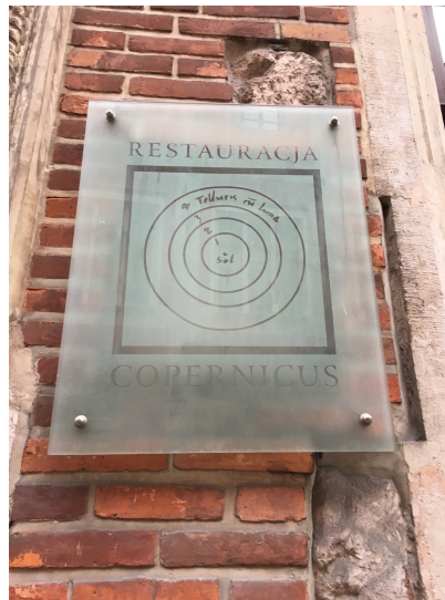
Figure 3: Solar system