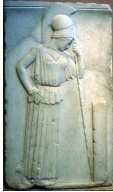
Figure 7: Greek Goddess Athena

The landscape of top quark dynamics is very different from \Delta B \neq 0 \neq \Delta C , as I had ‘painted’ it, see the Figure 6 above. To find its direct impact, power is not enough – we have to think, see the Figure 7 .