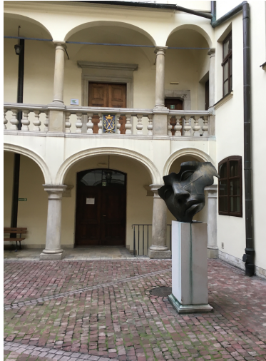
Figure 4: Renaissance architecture & modern sculpture