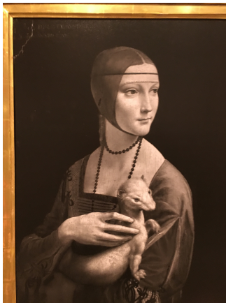
Figure 6: ‘Lady with an Ermine’ by Leonardo da Vinci

First one analyzes the data using model-independent techniques [23], compares them and discuss the results – but that is not the end of our ‘traveling’. Well-known tools like dispersion relations are ‘waiting’ to apply – but we have to do it with some ‘judgement’. I had visited a museum in the north Wall of Krakow and looked at this painting, see the Figure 6 : I was very happy to see it again – but after more looking at that, I realized