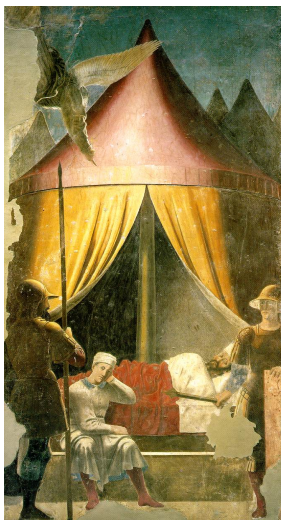
Figure 8: The dream in the night before the battle by the Milvian Bridge over the Tiber of a true collaboration.

The painting of Piero della Francesca shows the dream before the crucial battle outside of Rome between Constantine and Maxentius on different dimensions, see Figure 8 10 . Kolya Uraltsev & I had looked at this painting in person and realized that it is symbol