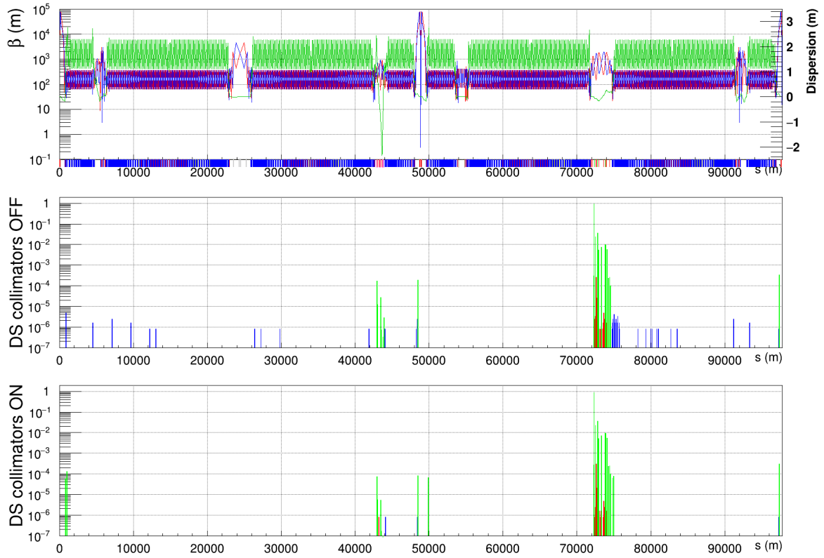
Figure 2: An image showing the current FCC-hh loss map with and without DS collimators using geant4 FTFP_BERT for the entire ring. A full description is given in the text.